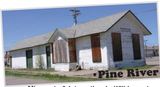
• Pine River

Minnesota & International~ Will be restored.