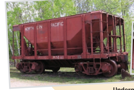
Northern Pacific ore car.

Small combination freight & open air passenger depot.