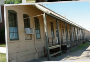
Downtown freight depot.

Crow Wing Fairgrounds~ Narrow gauge no-fire steam engine.